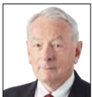
Richard Pound - KC, AdE

Retired Counsel - Stikeman Elliot Member - International Olympic Committee